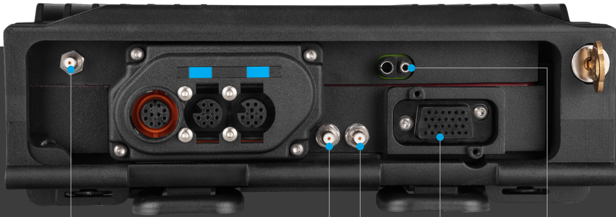
RF antenna port

When the mission takes you out of range, you risk being left in the dark. The APX 8500, equipped with SmartConnect, can reroute P25 voice and data communication over broadband via built-in Wi-Fi or a tethered LTE/satellite router. Stay connected to your P25 radio system, even when outside of P25 coverage.